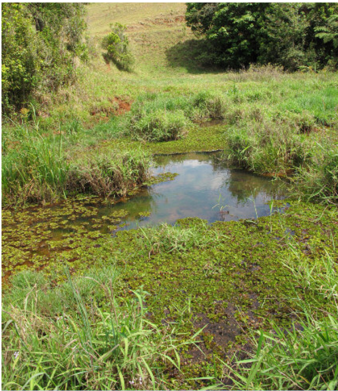
Upper unnamed tributary of Molo Creek. This was a source population for many of the Malanda Rainbowfish translocations.