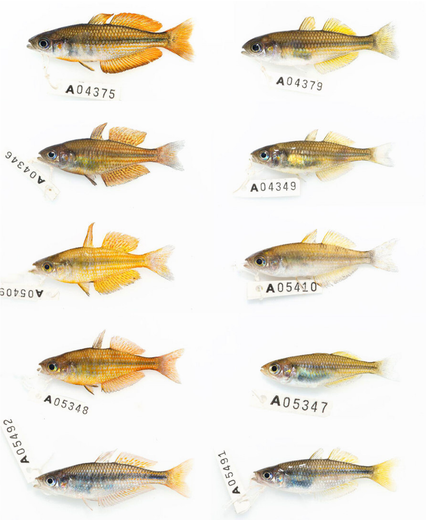
Pinned rainbowfish samples from upper North Johnstone streams; numbers represent museum codes. Males on the left with the corresponding female on the right. Top to bottom: Lake Eacham Rainbowfish from Dirran Creek. Malanda Rainbowfish – first from unnamed creek Wallace Road above falls; then Williams Creek East Branch at Jaggan; then Williams Creek West Branch. Bottom line is Eastern Rainbowfish from Gillies Creek, south of Tarzali.

Rainbowfish is a dwarf species, growing up to 61 mm for males (but usually under 50 mm), and females slightly smaller. The body is laterally compressed, con-