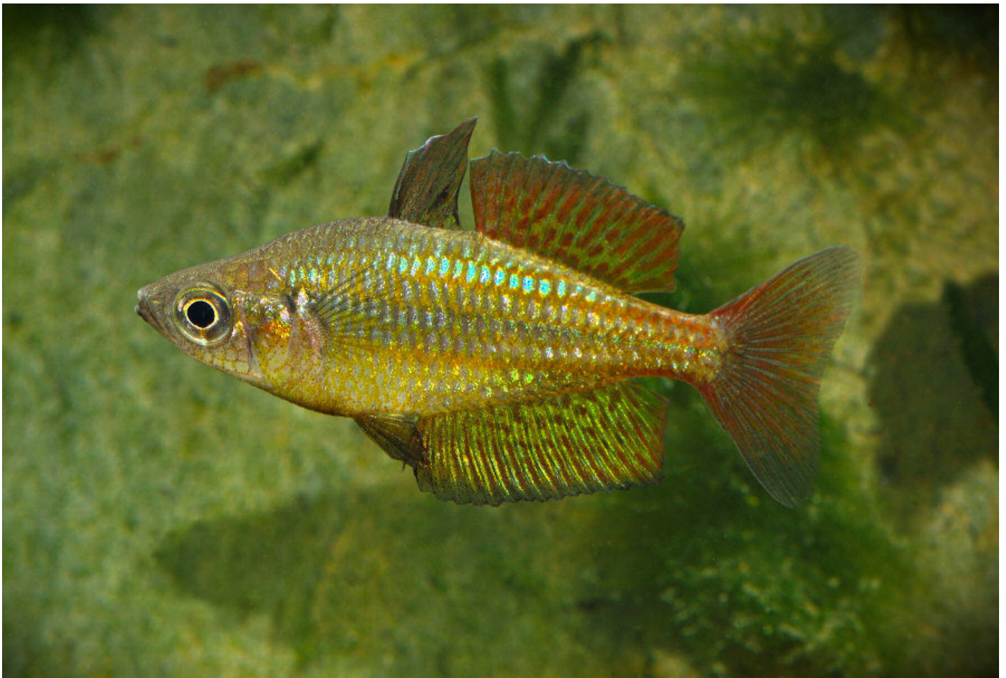
Male Malanda Rainbowfish from Williams Creek East Branch (45 mm TL).