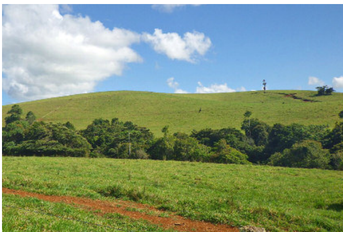
Typical modern-day landscape on the Atherton Tablelands – cattle country in the Williams Creek catchment.