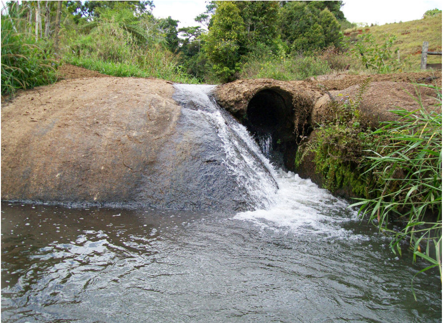
"Barrier" at causeway on lower Molo Creek. Below this barrier most rainbowfish were clearly hybrids, above they looked pure, but with some genetic introgression.