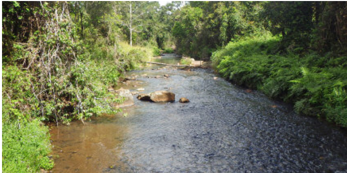
Ithaca River at Clarks Track, east of Jaggan, former Malanda Rainbowfish habitat.

The headwaters of the Ithaca River drains the western edge of the upper North Johnston catchment immediately north of Dirran Creek. This extensive system consists of several major tributaries that include a large unnamed tributary, then Thiaki Creek, its tributary, Molo Creek, and an unnamed tributary to Molo Creek. Ithaca River joins the North Johnstone River approximately 20 km downstream from Malanda. Our sampling has demonstrated an ongoing major decline in Malanda Rainbowfish. Prior to 2000, Malanda Rainbowfish were present well downstream in Ithaca River. The upper section of Ithaca River has two waterfalls a couple of hundred meters apart which have excluded rainbowfish from colonising the upstream reaches. Fish that looked primarily like Malanda Rainbowfish sampled in 2014 from lower Thiaki Creek showed genetic evidence of introgression with Eastern