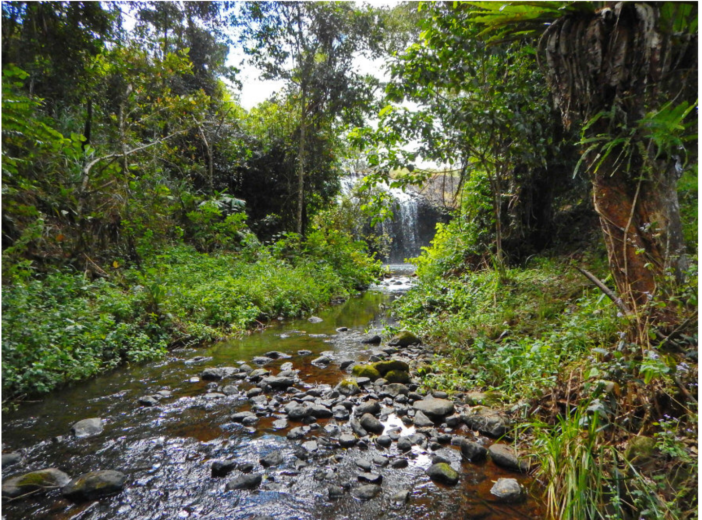
Upper waterfall on unnamed creek Wallace Road.