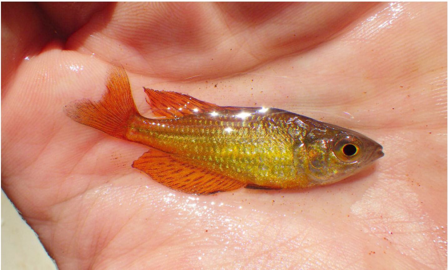
A magnificent “Malanda Gold” straight out of the net from Williams Creek East Branch at Jaggan.

The identity of the Malanda Rainbowfish as a distinct species has been confirmed through genetic study. Examination of different populations based on genetics has also allowed us to get an eye in for the physical