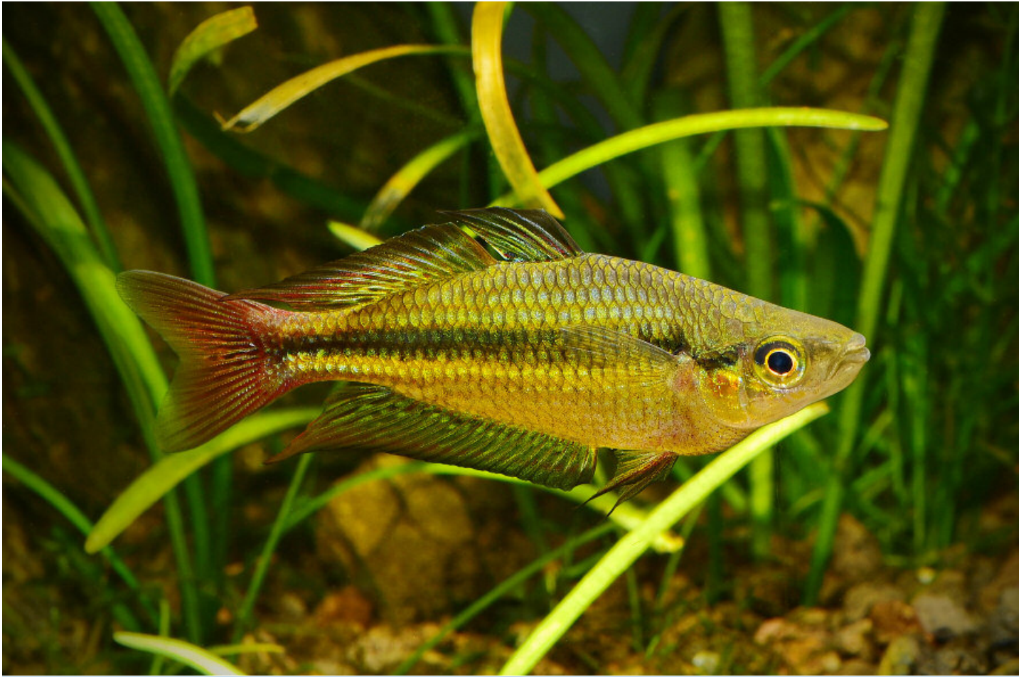
Male Eastern Rainbowfish from an upper North Johnstone tributary (75 mm TL).