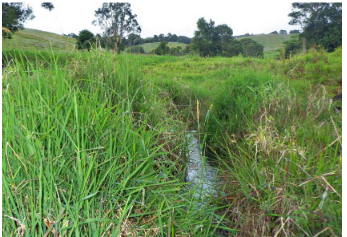
Unnamed creek Wallace Road, above upper waterfall. This section of creek is surrounded by dense Para Grass.