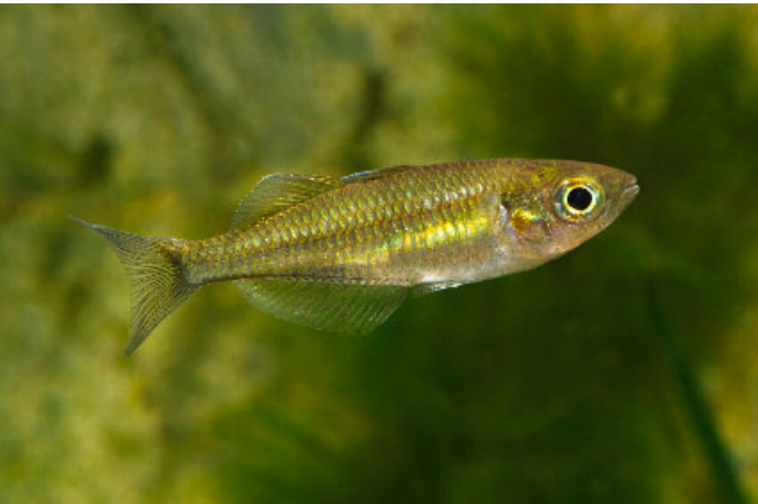
Female Malanda Rainbowfish from Williams Creek East Branch (35 mm TL).

The fish is named due to its restricted distribution in the headwater streams of the North Johnstone River in the Malanda district, on the southern Atherton Tablelands in Queensland. The Queensland Place Names Database gives the following origin for the name of the town of Malanda: "Derived from Malanda Creek, which reportedly is an Aboriginal name, lan-