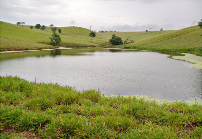
Farm dam by Thiaki Creek, one of the Malanda Rainbowfish release sites.

Given the precarious nature of remaining Thiaki and Williams Creek populations we have started a formally sanctioned and carefully considered program in conjunction with Queensland Fisheries to urgently translocate fish from wild genetically pure populations to refuge habitats (e.g., farm dams) in the upper North Johnstone catchment. As much as possible fish are being translocated within their existing sub-catchments, but we also intend to establish populations else-