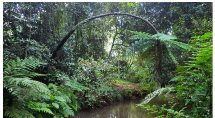
Mid reaches of Thiaki Creek, former habitat of Malanda Rainbowfish.