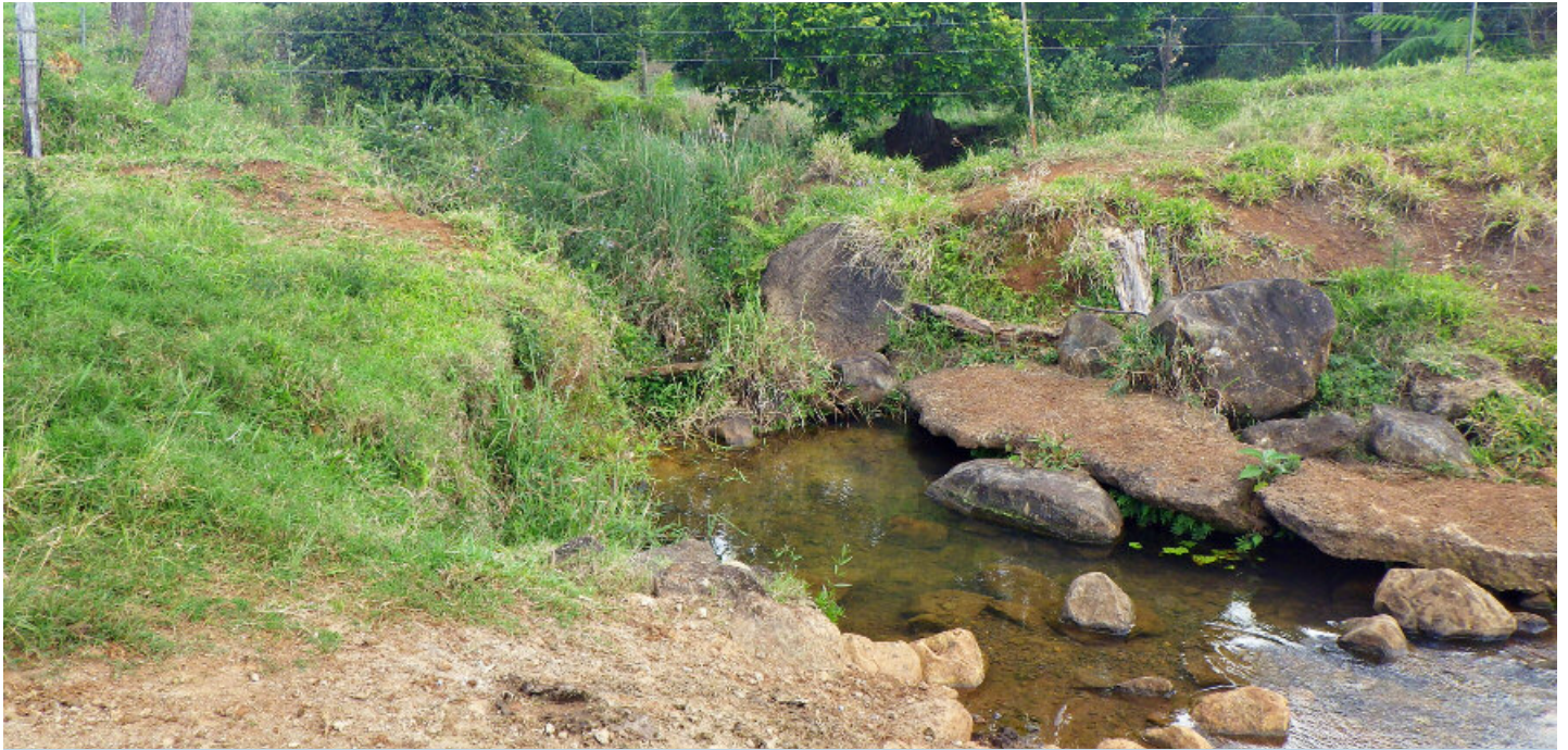
A minor barrier formed by a small dam on Williams Creek West Branch that represents the upstream limit of hybrid rainbowfish as of August 2016. Pure Malanda Rainbowfish were found upstream of this point.

based on pictures posted on the ANGFA forum, whereas by 2016 they were very clearly dominated by Eastern Rainbowfish. Two causeways around 950 m apart are present in the mid section of Williams Creek east branch. Both have drops of perhaps 15–20 cm, but would be easily passable during slightly higher flows. Rainbowfish below the lower causeway were clearly dominated by Eastern Rainbowfish hybrids, fish above the causeway looked like Malanda Rainbowfish (but are probably slightly mixed based on what we found upstream). At the upper causeway some rainbowfish below it appeared to have some introgression, but most were quite Malanda Rainbowfish like. Above the causeway we only observed Malanda Rainbowfish. We suspect though that fish both below and above this upper causeway probably have some introgression given the