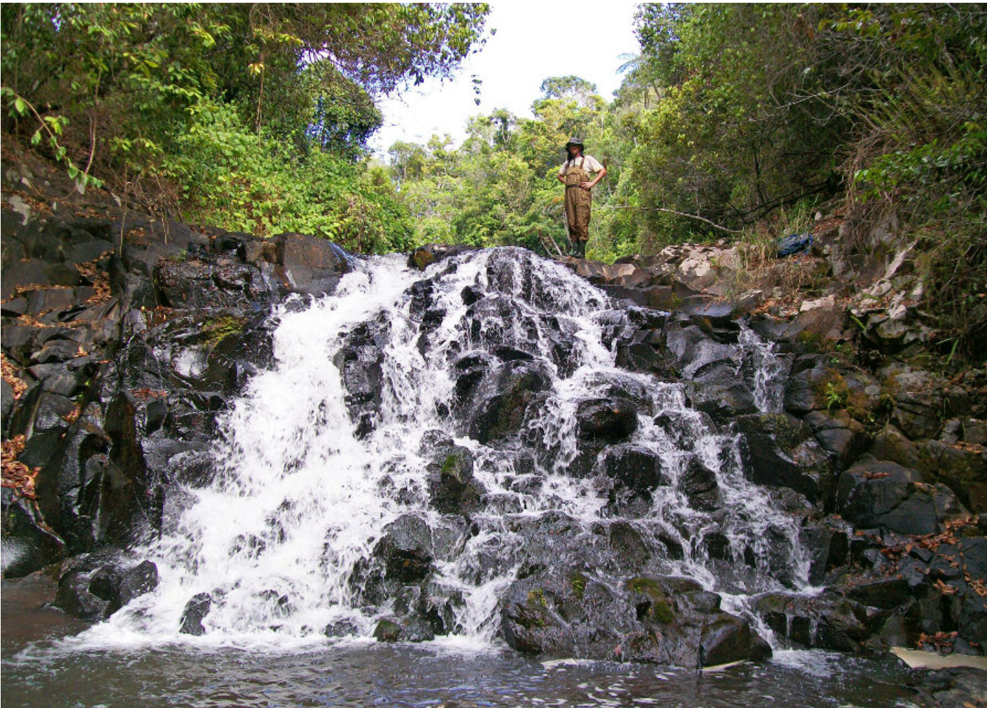
One of two waterfalls approximately 100 m apart on the Ithaca River that prevents rainbowfish occurring further upstream. Malanda Rainbowfish have now been translocated to the upper reaches of the river.

Rainbowfish. In 2016 the fish throughout Thiaki Creek were clearly quite mixed with Eastern Rainbowfish. Thus today virtually all of the Ithaca/Thiaki system contains Eastern Rainbowfish and/or hybrids with Malanda Rainbowfish, except for the upper most section of the unnamed tributary to Molo Creek and two small dams adjacent to lower Thiaki Creek on a small side tributary. Rainbowfish from upper Molo Creek proper have some genetic evidence of introgression (mixing) with Eastern Rainbowfish. In lower Molo Creek there is a concrete causeway about 900 m above the junction with Thiaki Creek. This causeway has a pipe with a small drop of perhaps 20 cm. Below the