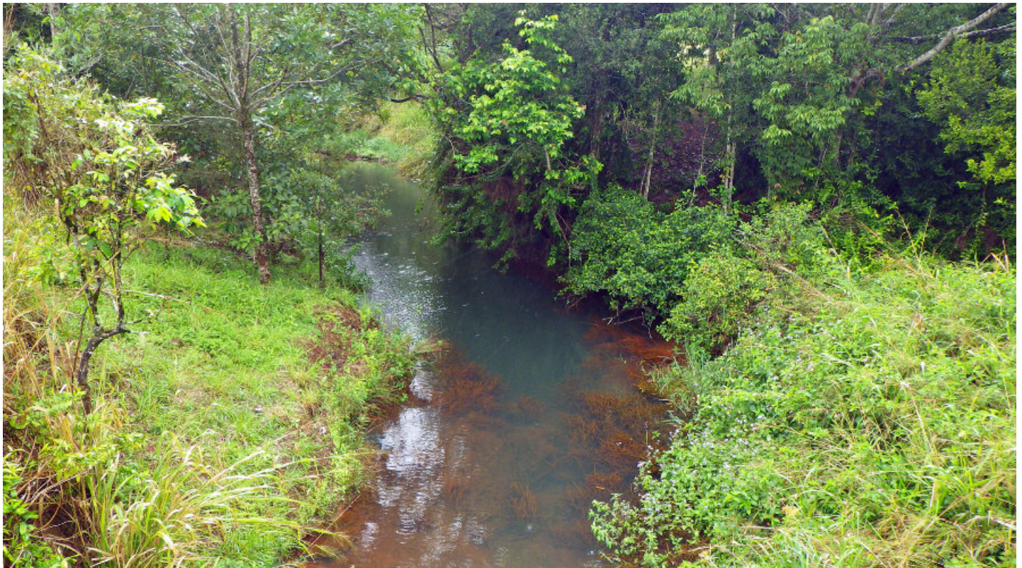
Williams Creek East Branch at Jaggan. This was a source population for many of the Malanda Rainbowfish translocations.