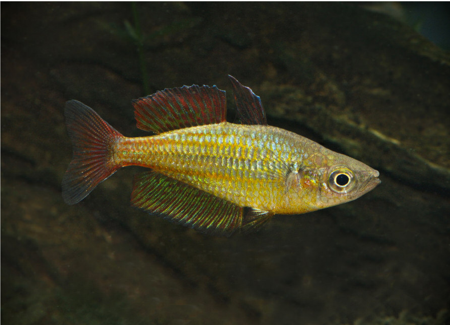
Male Malanda Rainbowfish from Williams Creek East Branch (45 mm TL).