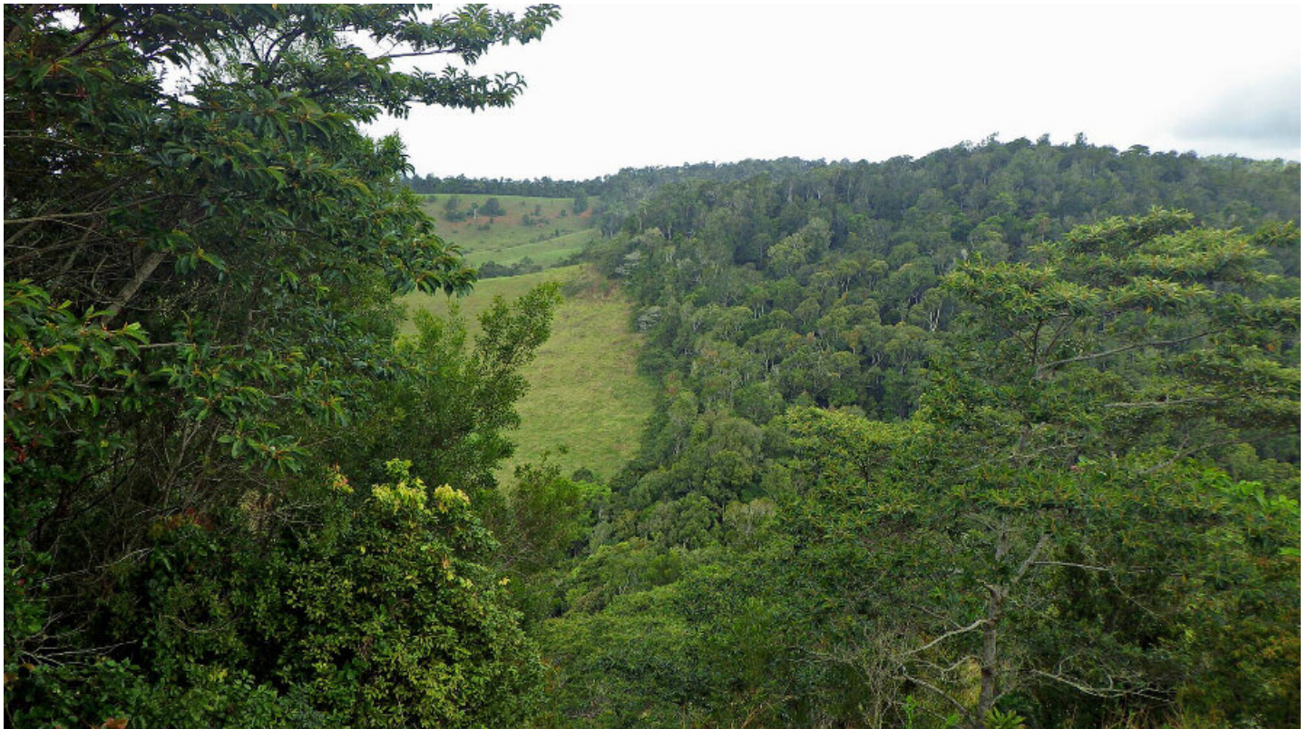
Rainforest bordering cleared agricultural land in the upper Thiaki Creek catchment. This entire region was once dense rainforest.