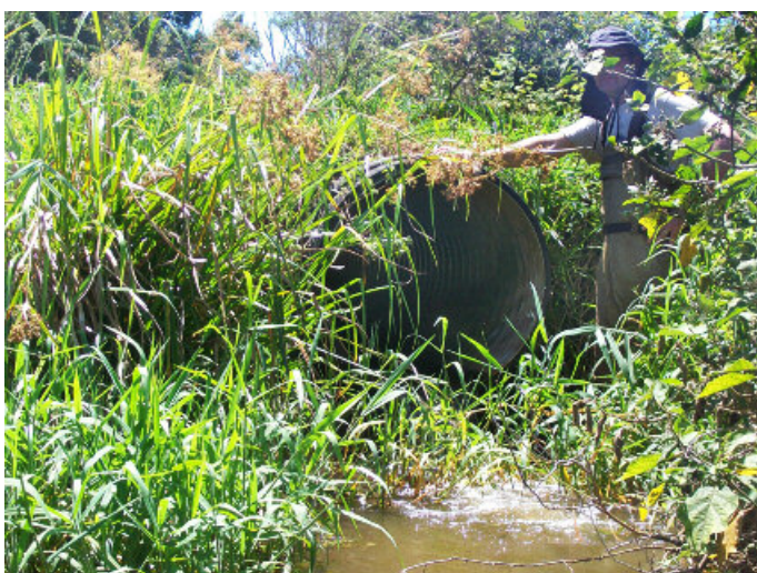
"Barrier" formed by the lower causeway on Williams Creek East Branch.