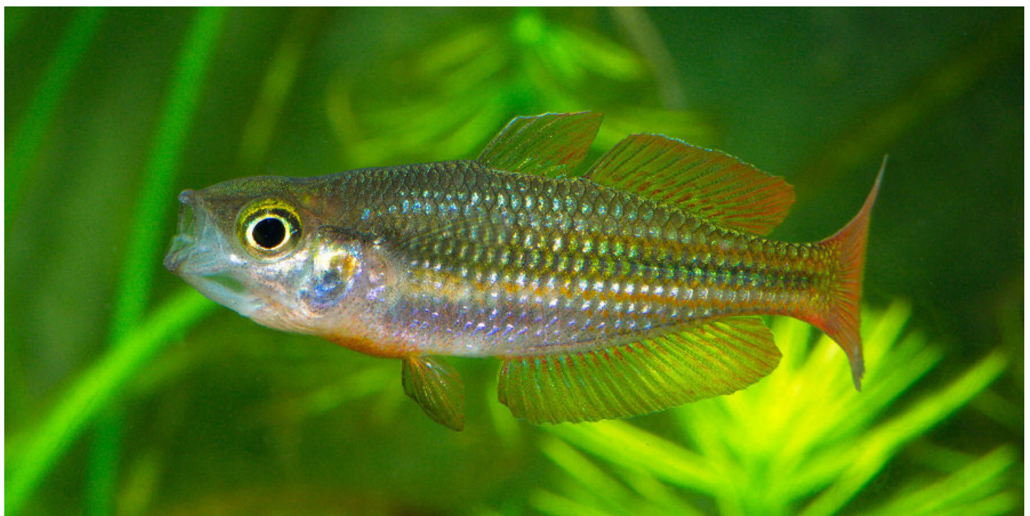
Male Lake Eacham Rainbowfish (yawning) from Dirran Creek, an upper North Johnstone tributary (50 mm TL).

Malanda Rainbowfish was likely common in many smaller rocky creeks in the area prior to European settlement.