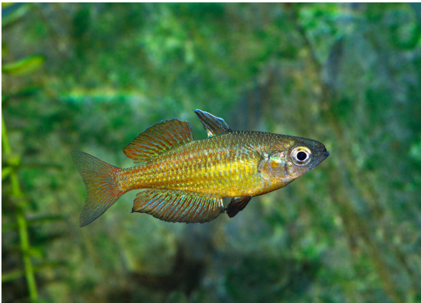
Male Malanda Rainbowfish (40 mm TL) from unnamed creek Wallace Road.

Incorporated Registration No. A0027788J. ISSN: 0813-3778 (print) ISSN: 2205-9342 (online)