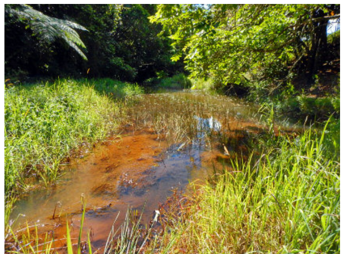
Upper Williams Creek West Branch. This was a source population for many of the Malanda Rainbowfish translocations.